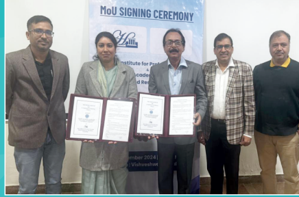
MoU with Healthrich Institute, Udaipur