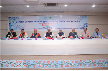
International Conference on Domain Beyond Patenting Emerging Fileds in Pharmacy