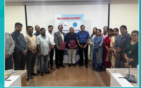
MOU with Chem Robotics