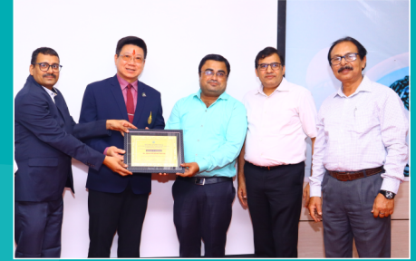
International Conference on Novel International in Pharmaceutical & Herbal Drug Research