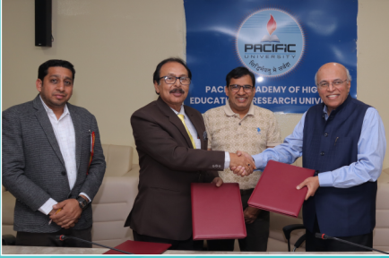
MoU with Centre of Excellences IPR Goa