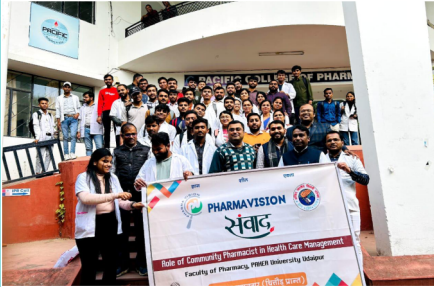
Workshop on Role of Community Pharmacist in Health Care Management